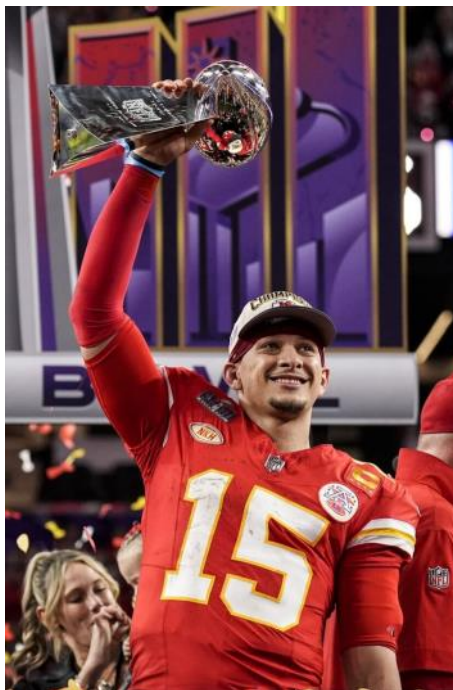
Patrick Mahomes, Superbowl MVP holding the Vince Lombardi Trophy after his third Superbowl win.

Patrick Mahomes won his 3rd Superbowl and his 3rd Superbowl MVP making him the 2nd youngest to do this in Superbowl history.