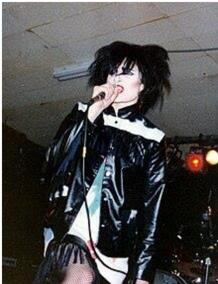
Siouxsie Sioux performing in New York City in 1980.

Goth and Punk differ in many different terms. Whether it be based on fashion, lifestyle, political values, etc., both genres share a similar crowd of people. Something to also note, many songs you hear today, whether it be on the radio or any other streaming platforms, share sample pieces from goth/punk songs.