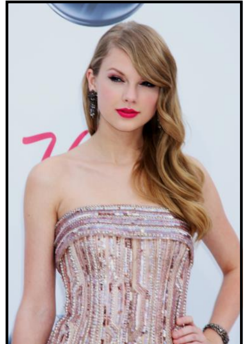
Taylor Swift arriving at the 2011 Bill-board Music Awards in Las Vegas, NV

Taylor posted on Instagram the 17-song track list. The album has two songs that feature artists like "Fortnight" featuring Post Malone and "Florida!!!" featuring Florence + The Machine. The song names leave fans excited as they believe that the album may have some con-