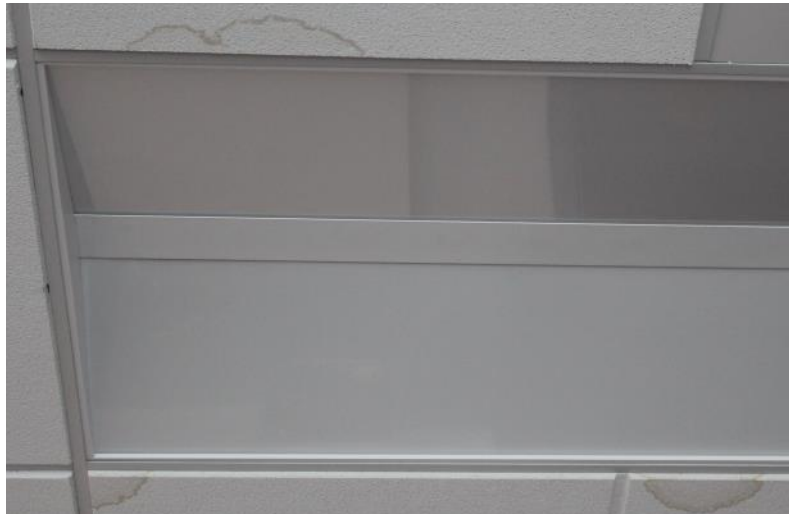
Flood causes leaks in room A214 after only 2 years since opening the new campus.

sent out a survey to ask teachers and staff if they were having any problems with leaks and water stains in their rooms. He received 43 responses but said, "an accurate number of water stains would be about 80". He also said that because of the rain, people are not able to come in and fix these issues but that they should be getting them solved soon.